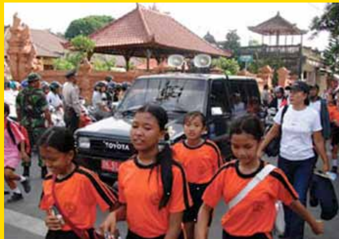
Bali school children follow a designated tsunami evacuation route as part of an Indonesian Tsunami Drill, December 2006.

National and local exercises are good to measure the effectiveness of plans and allow to practice skills according to a scenario in a simulated environment.