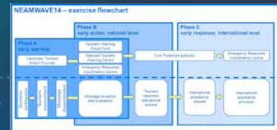
Flowchart of the Exercise NEAMWave 14